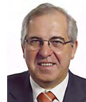
José Albino Silva Peneda Portugal, EPP-ED

With their support, the number of Members of the European Parliament who have pledged their support to Alzheimer Europe by either signing the Paris Declaration or joining the European Alzheimer's Alliance has been increased to 82. Alzheimer Europe can now count on the support of Members of the European Parliament from all seven political groups and from 22 of the 27 Member States of the European Union: