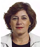
Ana Maria Gomes Portugal, PES