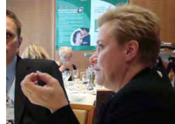
Sirpa Pietikäinen, MEP (Finland) asks for clarifications